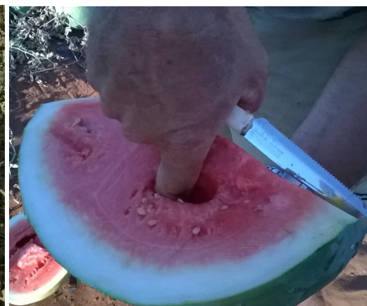
Fruit with internal breakdown and cavities. Note the patch of rotten/mushy flesh, whilst the rest of the flesh is still relatively normal.