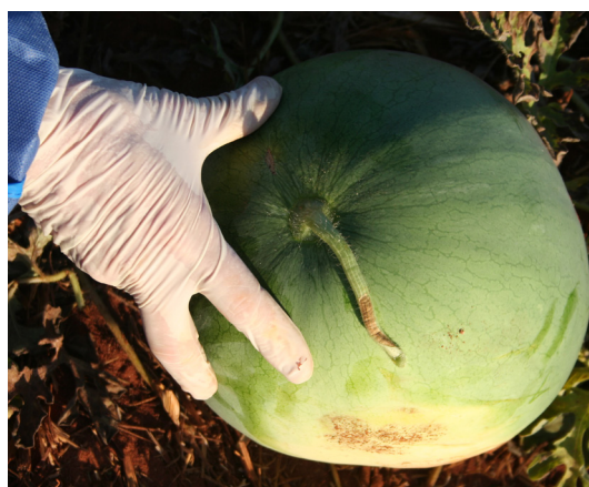
Fruit with necrotic patches on stalk.