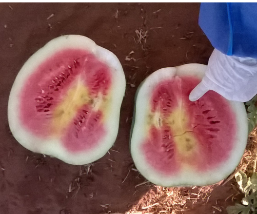
Fruit with yellow patches in flesh. (most extreme case observed)