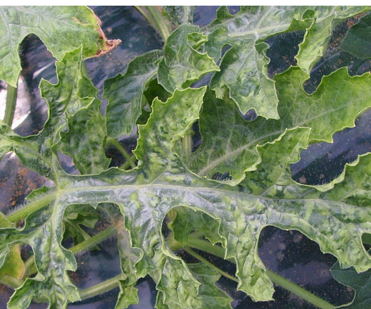
Leaf mottling. Photo taken overseas © Monsanto