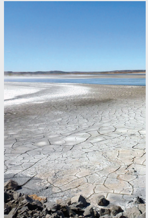
View from the same location in mid-2015