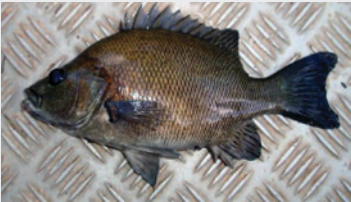
Sooty grunter

While fish outside of the mine site were found to contain metals above guideline levels, results show that this is likely to be from natural sources rather than mine operations.