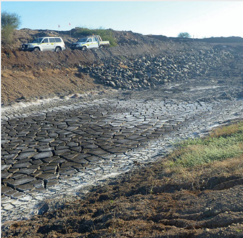
Sediment settlement basin to the southeast of Barney Creek haul road bridge