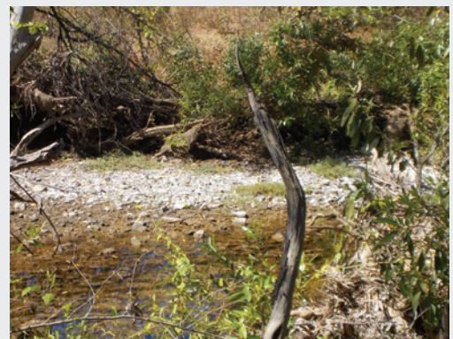
Seepage at Surprise Creek

Further progress has been achieved in managing the tailings storage facility. The challenge remaining for MRM is development of a strategy that demonstrates the long-term containment of tailings and management of seepage.