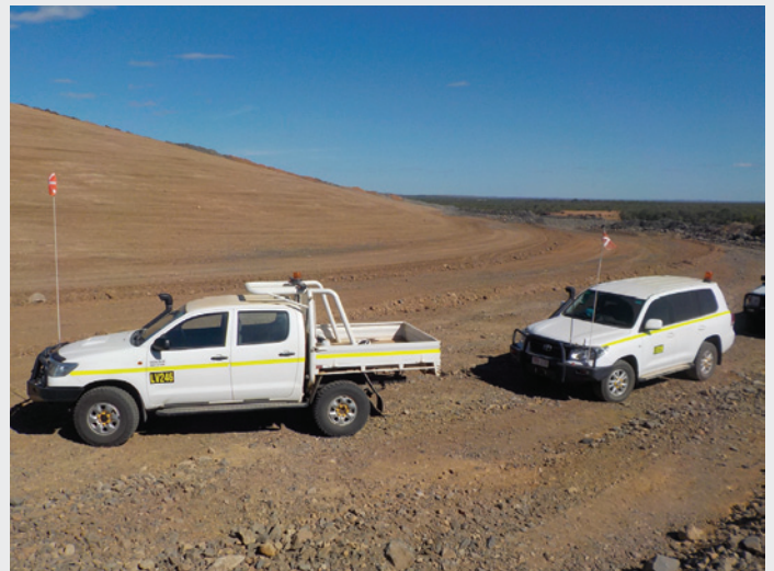
Rock capped with a layer of clay to protect it during the wet season