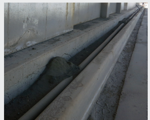
Spillage of dust from concentrate shed