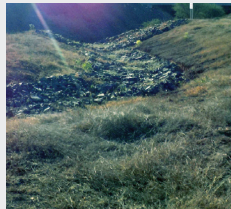
Post-settlement runoff channel