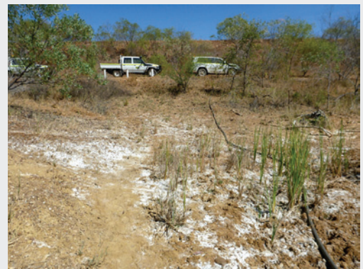
Seepage from TSF Cell 1