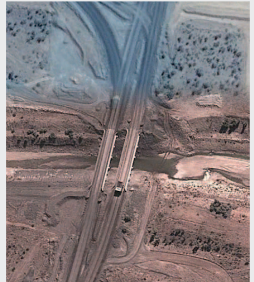
Satellite image of Barney Creek haul road bridge

Streambed sediment collected at this location also contained more metals than other Barney Creek sites, including lead and zinc results 8 and 11 times the Australian soil quality guidelines, respectively.