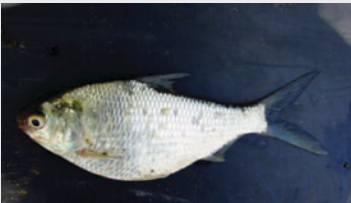
Bony Bream