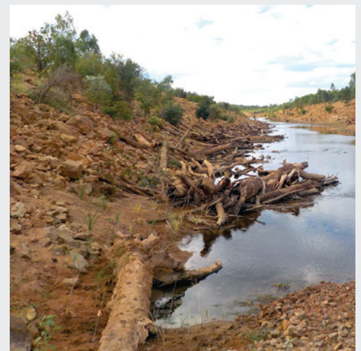
Large woody debris in the McArthur River diversion channel: providing fish habitat, protecting new revegetation, stabilising banks and reducing erosion.