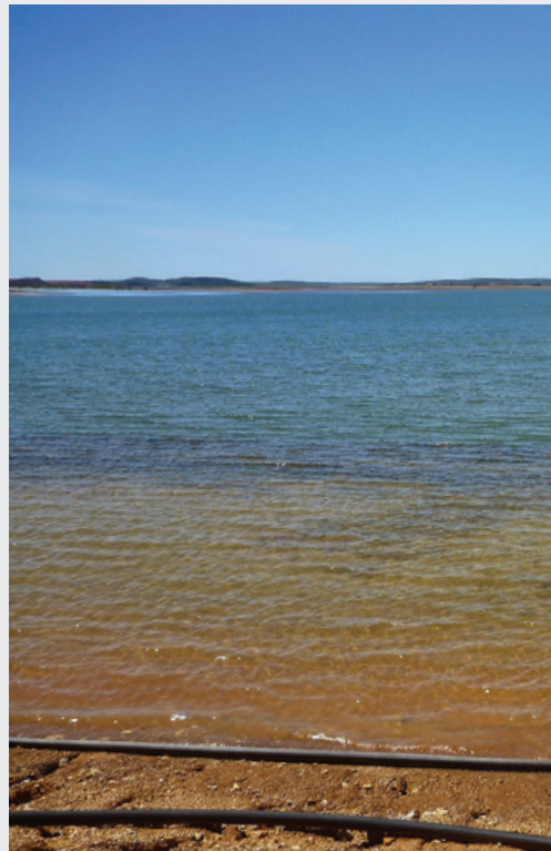
View across TSF Cell 2 in early 2014

The tailings are deposited in thin layers which allows them to dry out and consolidate, increasing the strength of the TSF.