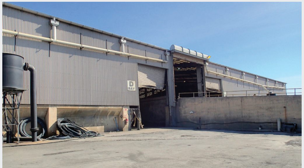
Doors of concentrate shed not able to be closed

As well as monitoring dust on land surrounding Bing Bong Port, MRM has monitored water quality in the swing basin and shipping channel, which can be impacted by dust. Due to a change in methods, in 2014 the twice-yearly marine sediment sampling program in the swing basin and shipping channel was not undertaken. The IM recommends that this program should be reinstated in 2015.