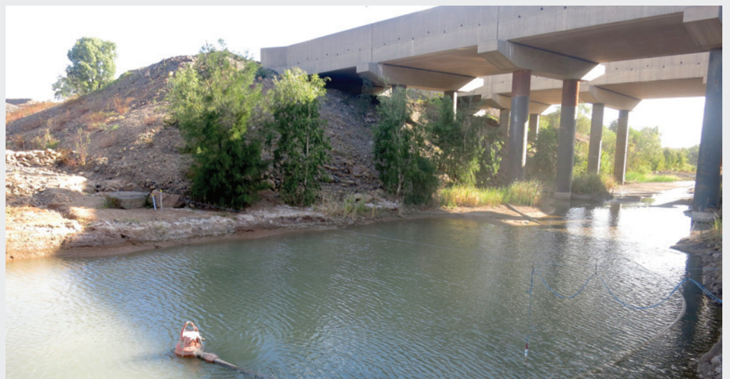
Barney Creek showing haul road bridge and dewatering pump in temporary dam

Lead exceedances were also recorded in 2 out of 12 fish caught upstream of the mine site, reflecting the high mineral content in the natural environment. Further information is provided on page 10.