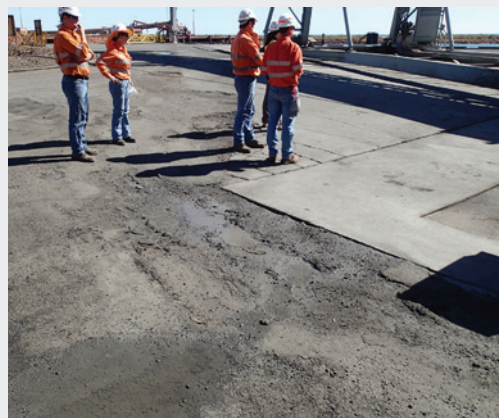
The bitumen surface around the loading facility requires repair