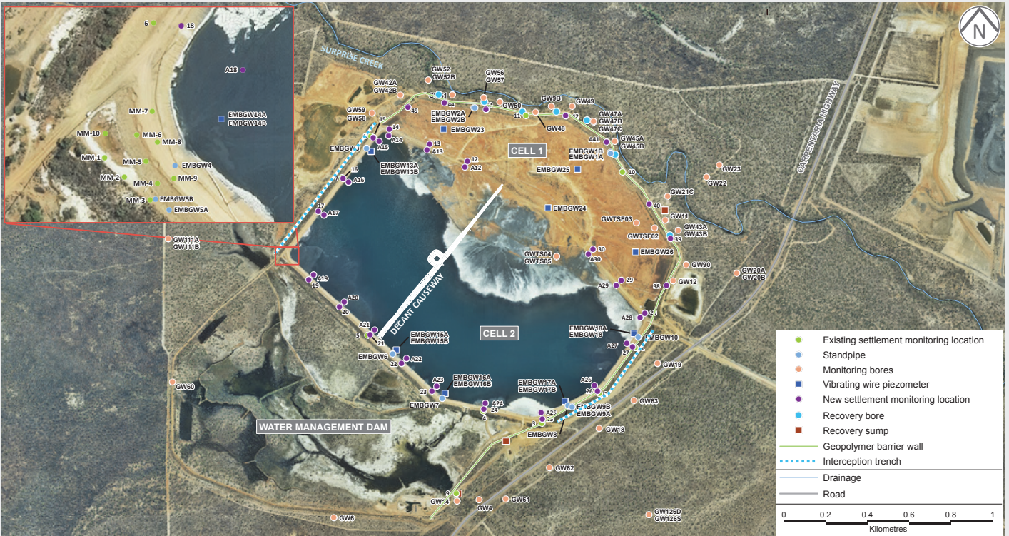
Aerial view of TSF, showing monitoring points and management features (Note: The amount of water shown in Cell 2 in this image does not reflect its current state.)