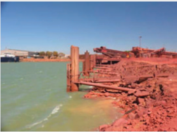
Red dust at Western Desert Resources' loading facility, with MRM's concentrate shed visible to the left.

During 2014, a large amount of red dust (from iron ore) was blown across the area to the west of Bing Bong Port. This dust is from the operations of Western Desert Resources (WDR, a separate company to MRM), which involved stockpiling and loading of iron ore onto barges in the port. WDR stopped operating in September 2014.