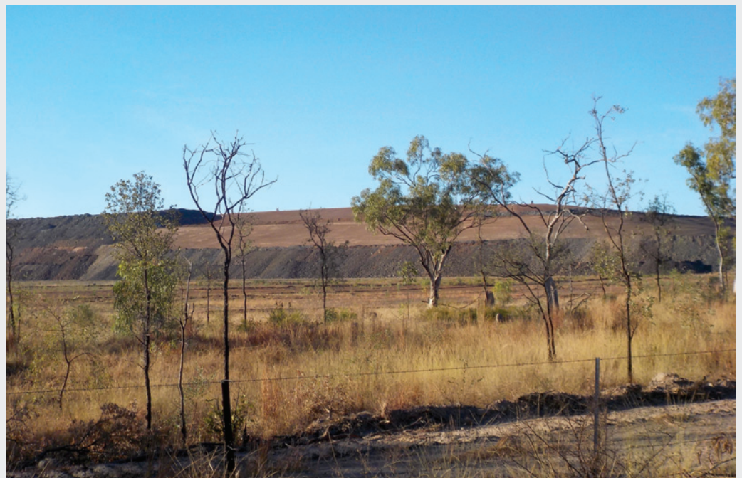
The Northern Overburden Emplacement Facility viewed from the Carpentaria Highway