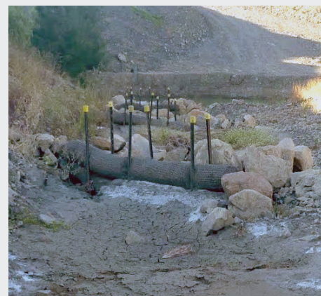
Silt traps in the lower part of the post-settlement runoff channel