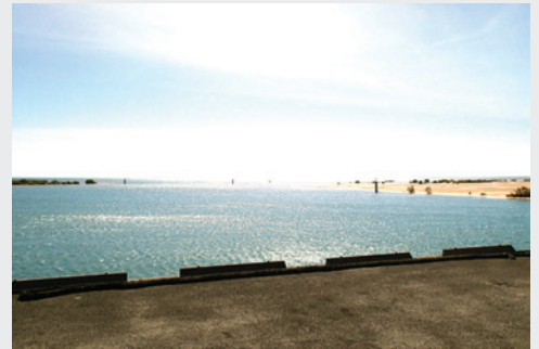
View to the north from Bing Bong Port

MRM did not undertake any dredging of the shipping channel during the 2014 operational year, and as such, potential risks to the environment related to the dredge spoil ponds were reduced.