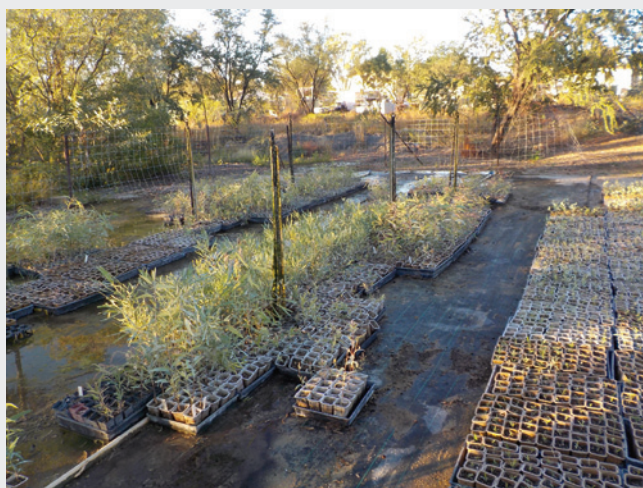
McArthur River Mine plant nursery in June 2015