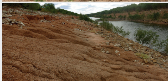
Bank erosion in the middle section of the McArthur River diversion channel