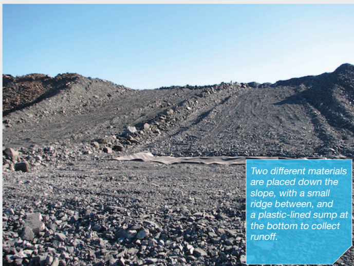
Cover erosion and runoff trials