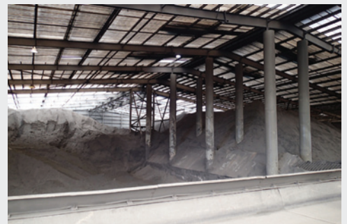
Inside the concentrate shed