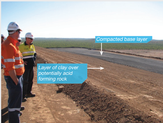
Waste rock with interim clay capping

Further progress has been achieved in understanding the geochemical properties of waste rock and materials on site at the mine. The challenge remaining for MRM is to propose a strategy which can demonstrate that the waste rock can be rehabilitated with minimal long-term impact.