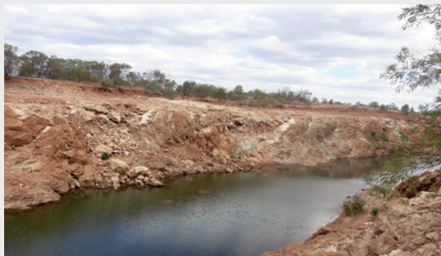
Lower section of the McArthur River diversion channel

The IM commends MRM for increasing the proportion of plants grown in the on-site nursery to 85% in 2014 (instead of sourcing from off-site).