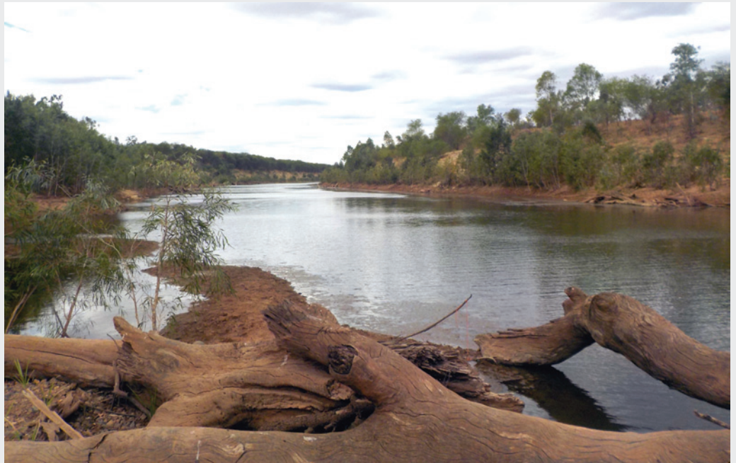
Advanced revegetation in the upper part of the McArthur River diversion channel, with large woody debris in the foreground.

Aquatic surveys identified that LWD installation has had an almost immediate positive effect, with many more fish using these sites as opposed to areas with bare banks. Recent revegetation has included planting within the sediment trapped behind LWD piles.