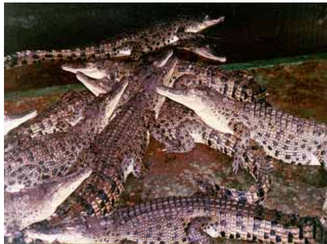
Figure 1. Processing size crocodiles

All individuals and companies trading in crocodile products must comply with the conditions of the NT Crocodile Management Program which was developed in accordance with requirements of the Territory Parks and Wildlife Conservation Act 1993 and Wildlife Protection (Regulation of Exports and Imports) Act 1982 . Trade in crocodile products is regulated by the licensing and permit provisions of these Acts. The industry also follows the guidelines of the Crocodile Industry Strategy , developed by the Northern Territory Government.