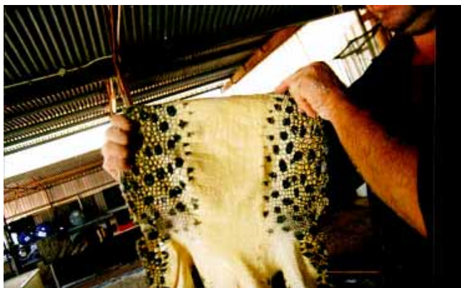
Figure 2. Raw belly skin

If the product is a finished item leaving Australia as a commercial shipment, a CITES export permit (Manufactured Crocodile Products), is supplied to the purchaser by the retailer. This permit provides verification that the product originated from an approved management program. When a finished item is carried in personal luggage as a gift, a CITES product label is not legally required but may be issued on request.