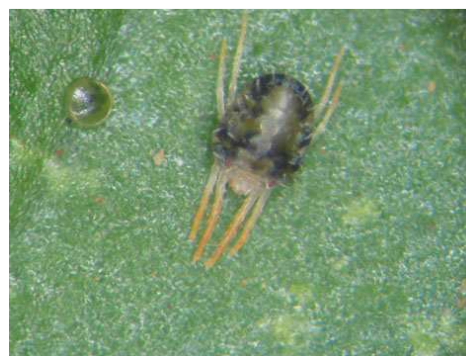
Oriental red mite adult and egg

Spider mites are given their name as they often spin characteristic protective silk webs. This family has more than 1000 species, which include some species of quarantine importance, and many species that may cause heavy losses to major food crops and ornamental plants. These include the infamous two-spotted mites Tetranychus urticae , and other major economic spider mite pests, which have been recorded in the Northern Territory e.g. oriental red mite, Eutetranychus orientalis - primarily a pest of citrus; vegetable spider mite, Tetranychus neocaledonicus ; and avocado brown mite, Oligonychus punicae . These species attack a wide range of horticultural crops. Mites may cause serious damage to plants but since they are microscopic they are usually not noticed until damage symptoms appear on the plant.