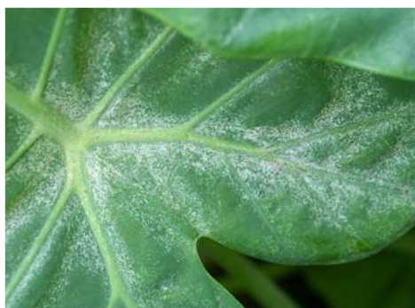
Spider mite damage to taro leaf