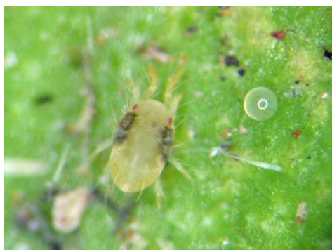
Two spotted mite adult and egg

Mites that are plant pests include spider mites (family Tetranychidae), false spider mites (family Tenuipalpidae), tarsonemid mites (family Tarsonemidae) and the rust or gall mites (family Eriophyidae). These mites cause damage by piercing plant cells and sucking out their contents. In heavy infestations mites may even kill the host plant.