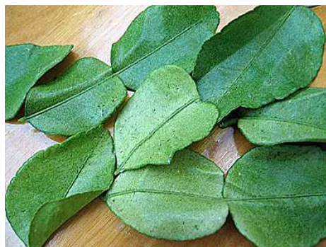
Oriental red mite damage to Kaffir lime leaves