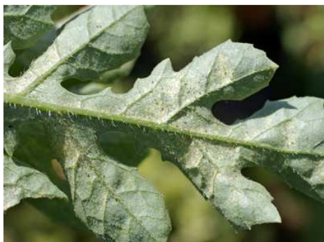
Spider mite damage to watermelon leaf

Oriental red mite, Eutetranychus orientalis , is primarily a pest of Citrus , however, the mite has several alternative host species such as cotton, squash, frangipani and grapevines. Oriental red mite damage is similar to that caused by two-spotted mite, infested leaves have a chlorotic appearance and may become weak and finally drop.