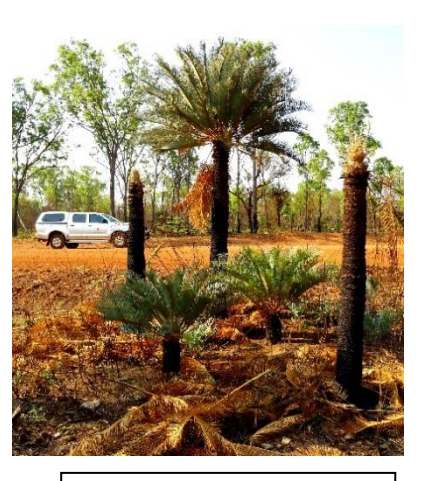
Figure 5 Cycas angulata