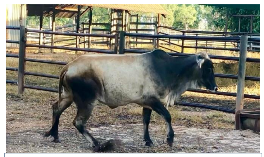
Figure 6 Typical presentation of developing zamia staggers: note knuckling of right hind fetlock causing staggering and ataxic gait