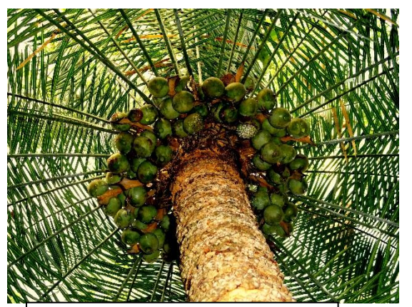
Figure 3 Seeds and fronds: Cycas