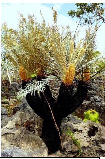
Figure 4 Cycas calcicola